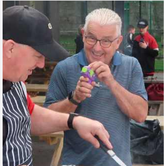
Is that a water gun?